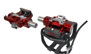
Morse Taper Triple Link™ Delta-compatible pedals

Core Health & Fitness is more than gym equipment, we offer innovative solutions for all your facility needs. This is why we've brought together five of the most recognizable fitness brands to ensure our customers can offer their members authentic fitness experiences. Whether working with us directly or through our partners and distributors worldwide, we provide the highest quality equipment backed by a service and support team that will always go the extra mile to get you what you need, when you need it. Partner with us and see how our Core Values motivate our every decision.