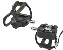
Standard Morse Taper Double Link™ pedals